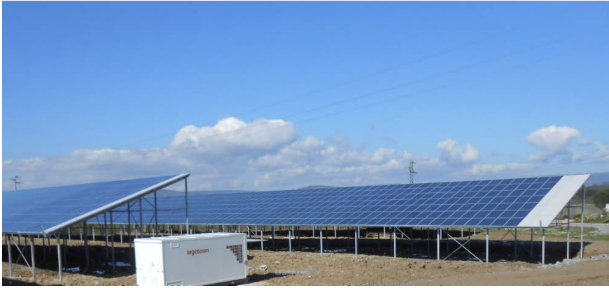
Ozieri (SS, Sardegna) 1 MWp